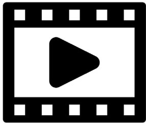
Listening To Their Story

Simple things like investing time and energy into our friendships, and showing genuine love and interest in the lives of your friends will create opportunities for deeper conversations about our faith and what we value.